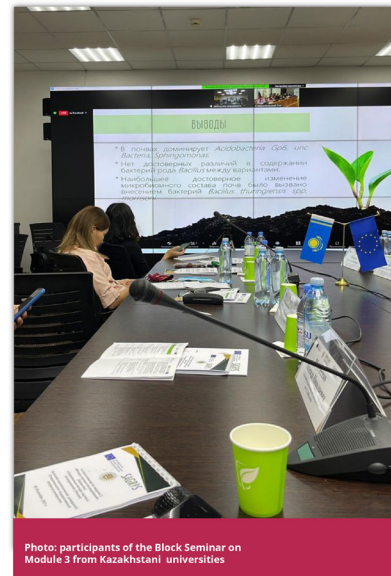
Photo: participants of the Block Seminar on Module 3 from Kazakhstani universities