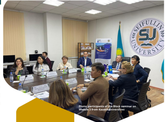
Photo: participants of the Block seminar on Module 3 from Kazakh universities