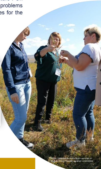
Photo: participants of the Block seminar on Module 2 from Russian agrarian universities