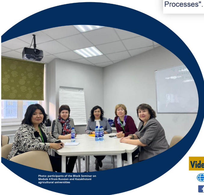
Photo: participants of the Block Seminar on Module 4 from Russian and Kazakhstani agricultural universities