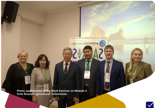
Photo: participants of the Block Seminar on Module 4 from Russian agricultural universities