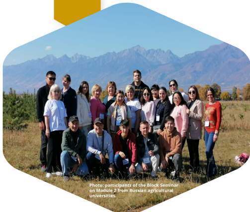
Photo: participants of the Block Seminar on Module 2 from Russian agricultural universities.

In addition to lectures and practical sessions, doctoral and postgraduate students participated in an open discussion on climate change and the assessment of natural resources in a changing climate, and there was a discussion on the scientific paper "Agriculture's Contribution to Climate Change and Role in Mitigation Is Distinct From Predominantly Fossil CO2-Emitting Factors". On the final day, the young scientists presented their group projects and solutions to existing problems in the face of climate change and participated in a roundtable discussion on "Challenges for the Future of Agriculture under Changing Climate".