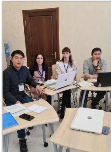
Photo: participants of the Block Seminar on Module 3 from Russian agricultural universities