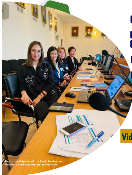
Photo: participants of the Block Seminar on Module 2 from Kazakhstani universities.

Video and photos of the Block Seminar here: