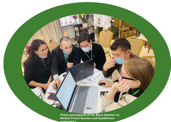
Photo: participants of the Block Seminar on Module 4 from Russian and Kazakhstani universities